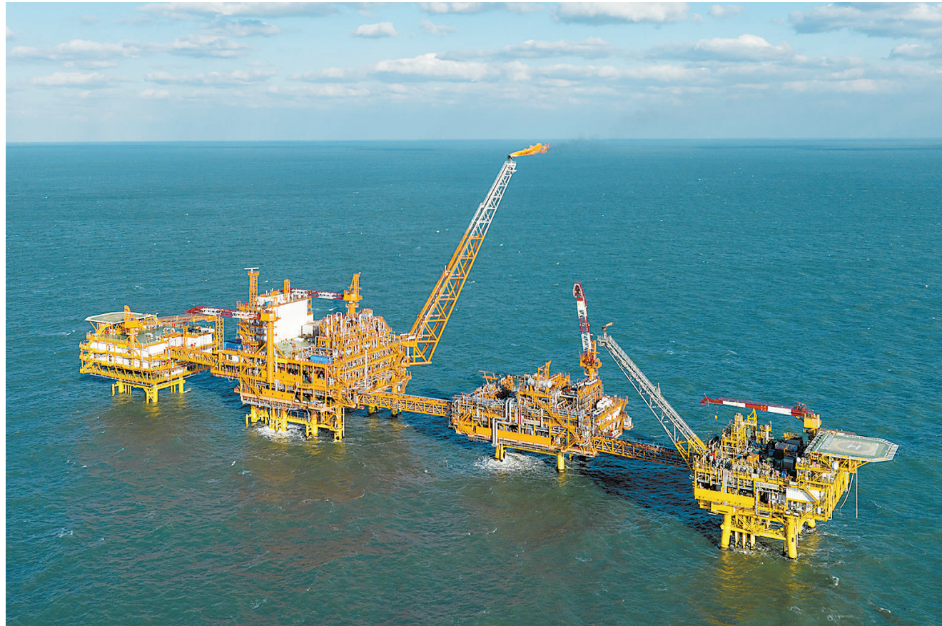
The Phase I project of Bozhong 19-6 Gasfield, the first 100 billion cubic meter gasfield in Bohai Sea, has been successfully put into operation, marking a new stage in the development of deep complex hydrocarbon reservoirs in China.

Eleven ministerial representatives attended GEO Week and nearly 1,000 representatives from the United States, the European Commission, South Africa, the GEO Secretariat as well as other GEO members, participating organizations and associates took part in the activities during the week.